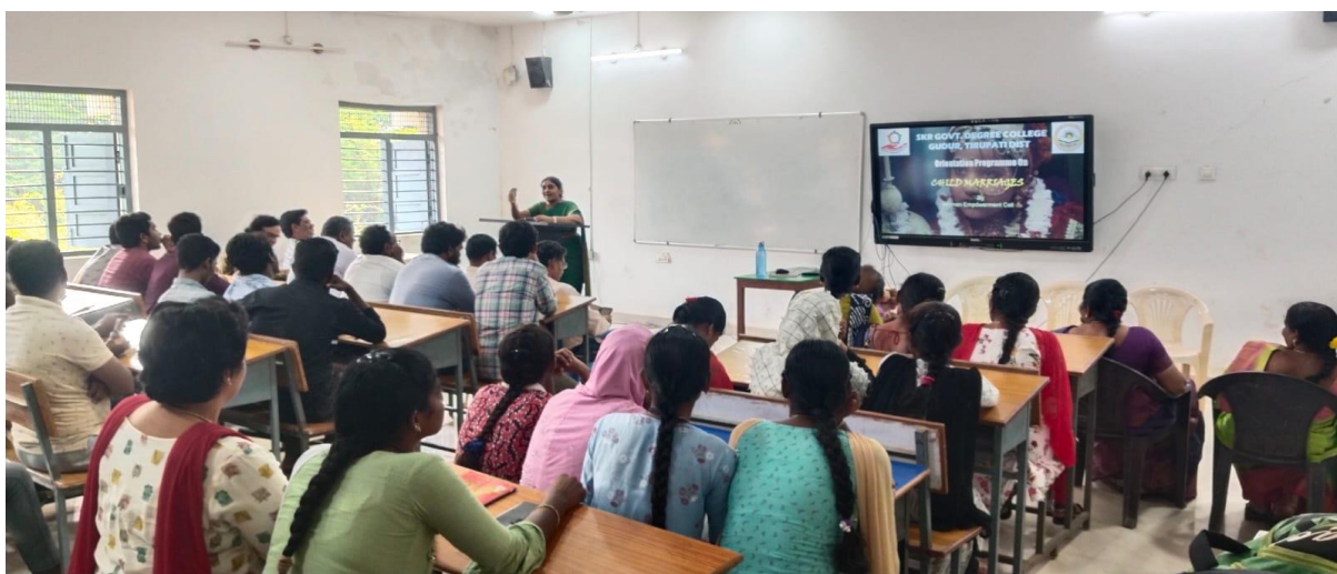
About the Programme By WEC Convenor Smt S.Kiranmaiye