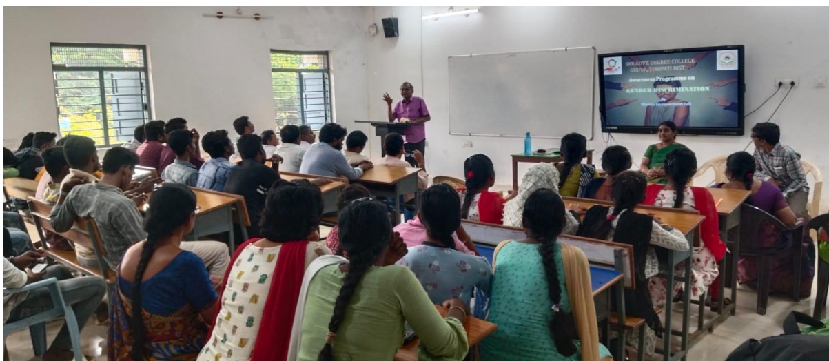
Opening Remarks by the Principal