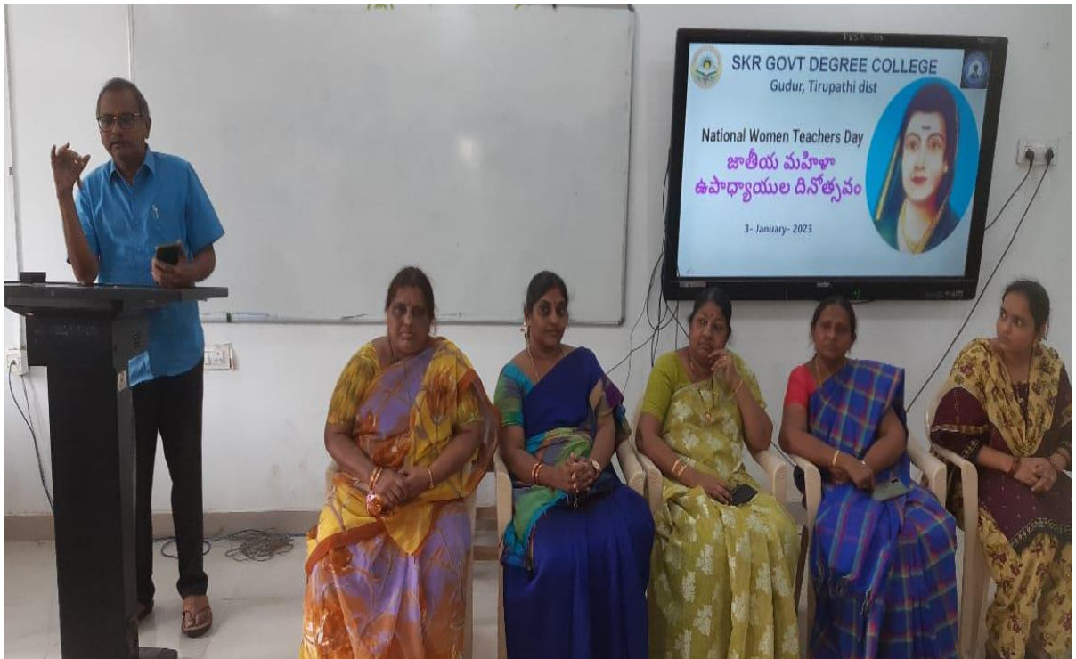
Opening Remarks by the Principal