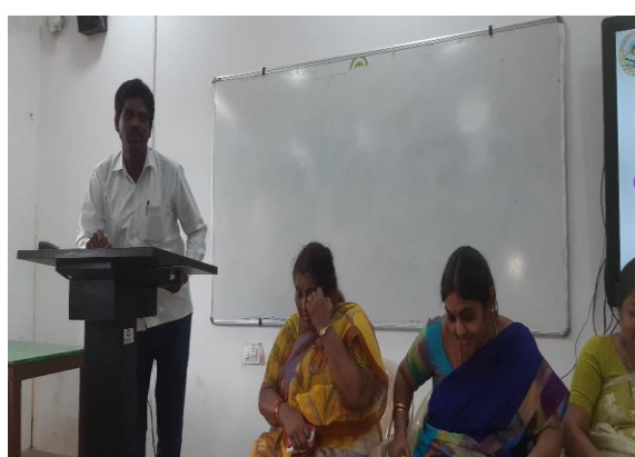
Speeches by the staff