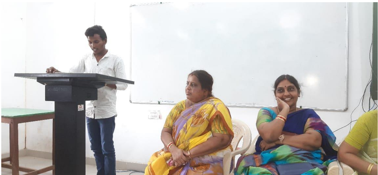
Speeches by the students