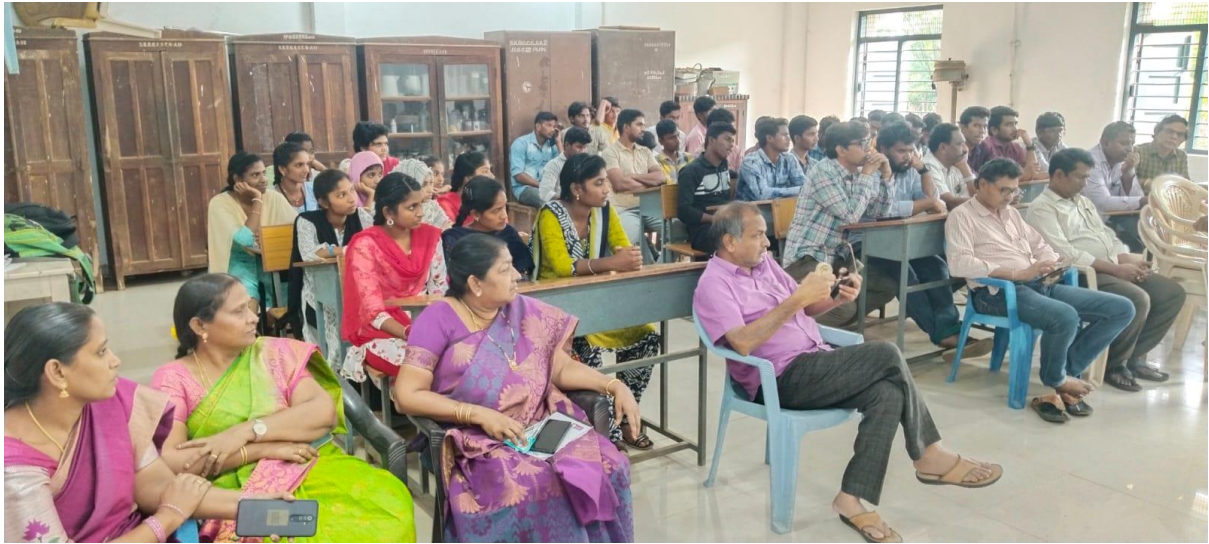
Gathering of the Programme