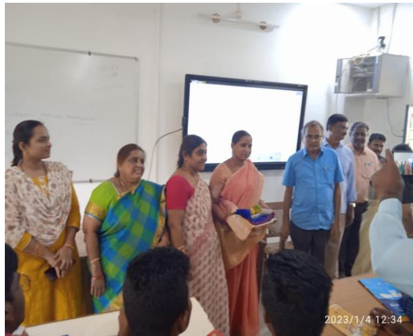
Felicitation of Female Teaching Staff