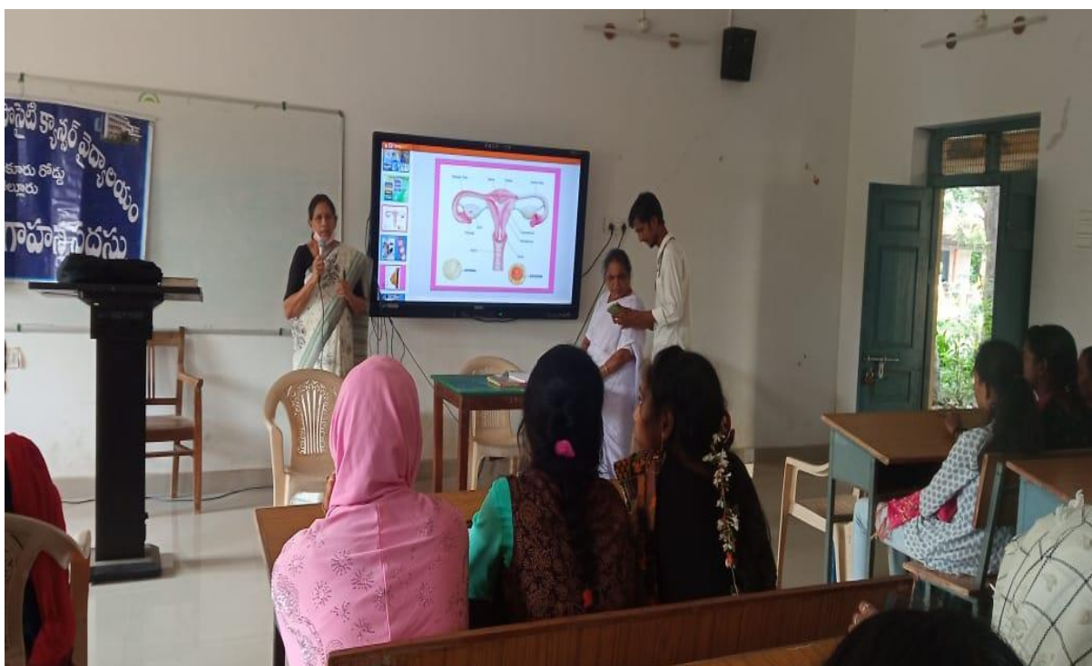
AWARENESS PROGRAMME ON CERVICAL CANCER BY Dr.T. Lakshmi, CMO, IRCSCH