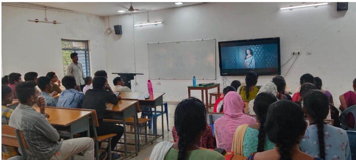
Short Film display on Gender based Violence